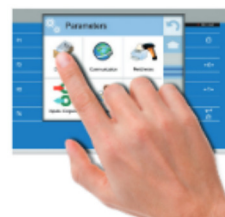
5.7" colour touch screen assuring intuitive operation