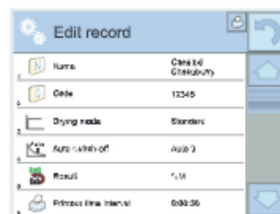
Drying programs and finish modes database