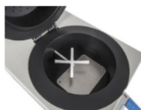
Chamber for moisture content determination of special design