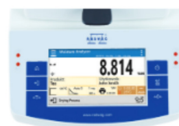
5" touch screen with customized buttons layout