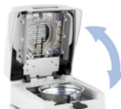
Automatic drying chamber's lid opening and closing