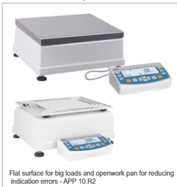
Flat surface for big loads and openwork pan for reducing indication errors - APP 10.R2