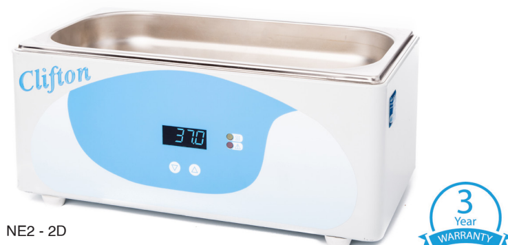
NE2 - 2D

Clifton ShallowBaths™ are available in digital or analogue option. Perfect for heating small height samples such as micro tubes, micro plates and bottles. These shallow baths require less water and less process chemicals, so are therefore economical to use.