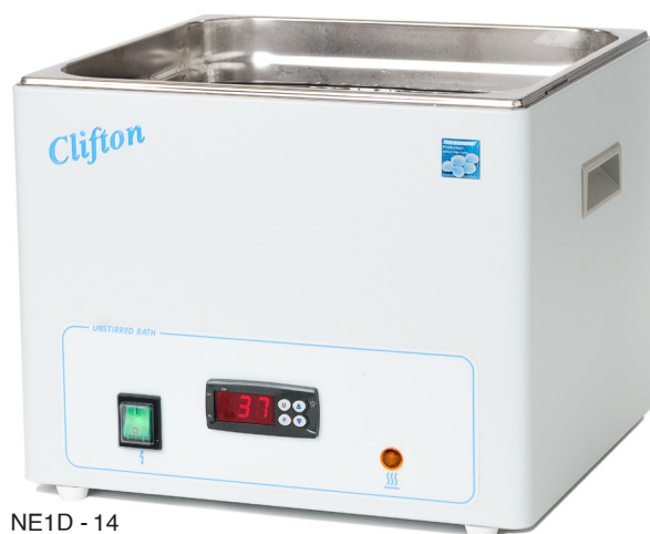
NE1D - 14